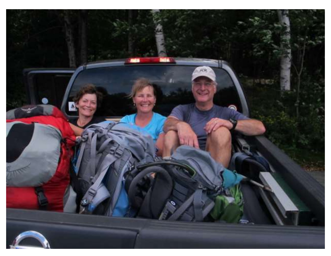
SEMers ready to head home after a hike...tired, but happy!