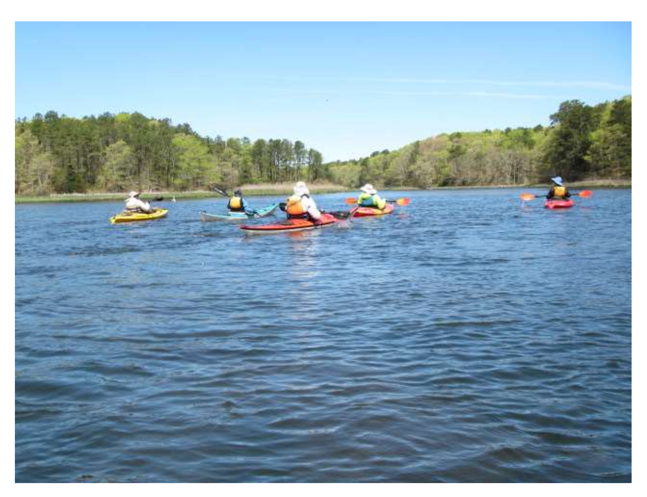
Paddlers heading up the Mashpee River in late spring

Respectfully submitted, Ed Foster, Paddling Chair