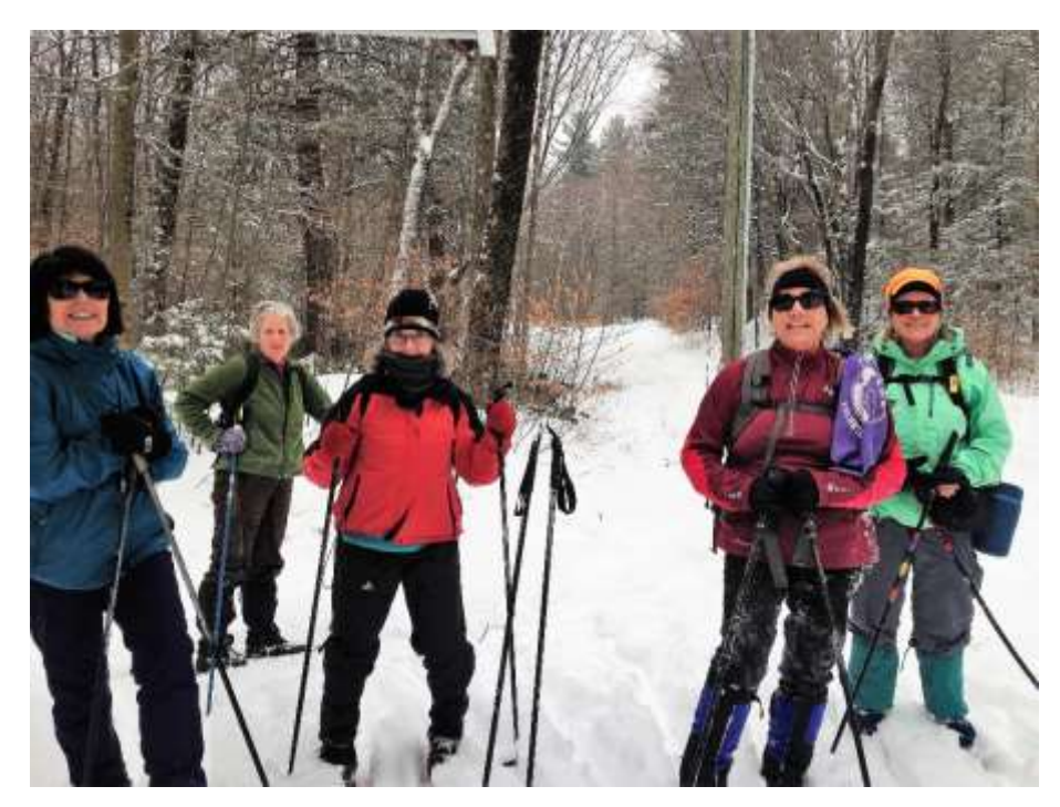
Skiing at Noble View

In February, Jeannine Audet and Walt Granda led a group of skiers and snowshoers for a weekend at Noble View Outdoor