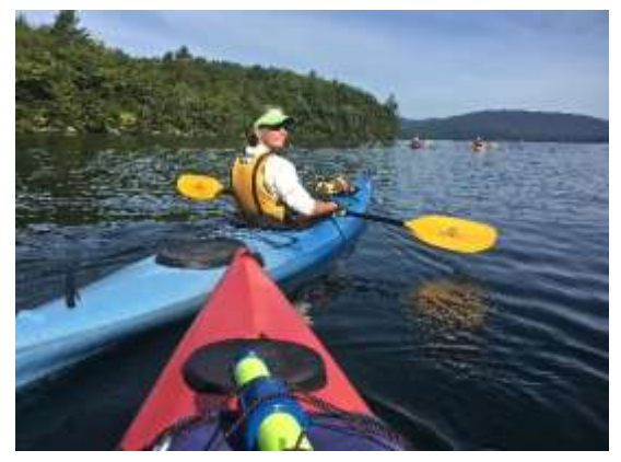
Paddling on Newfound Lake