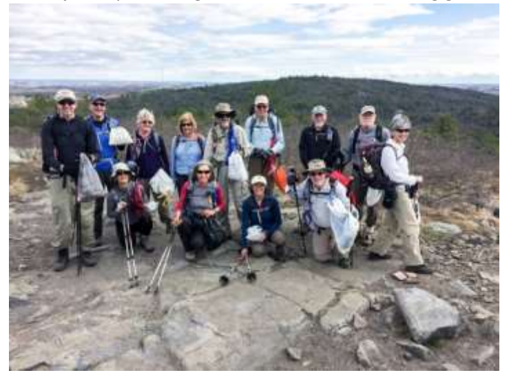
Earth Day Cleanup in the Blue Hills

In January, the Conservation Committee submitted an article to the Breeze on how we could all do a better job at preserving the outdoors for the coming generations. This included a link to an AMC