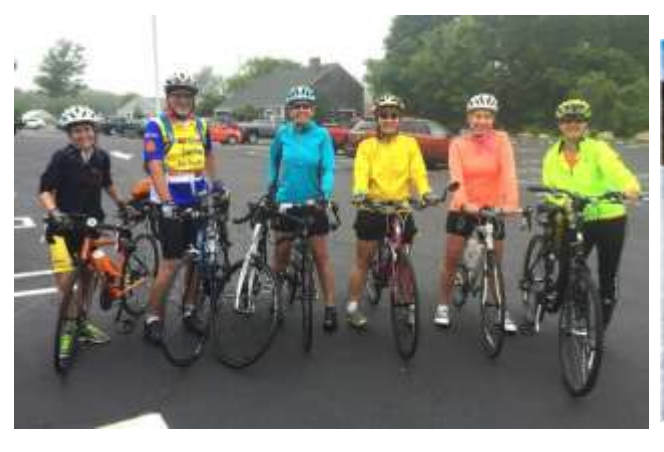
Westport Ride

Presented to the members of the Appalachian Mountain Club Southeastern Massachusetts Chapter at the 2017 Annual Meeting and Dinner at the Brookside Club in Bourne, MA, October 28, 2017.