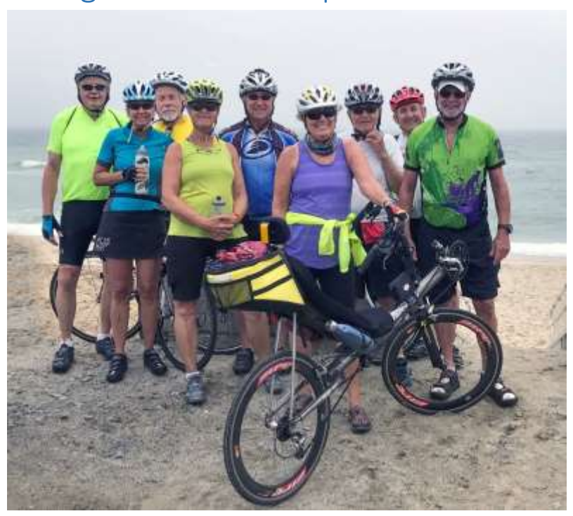
Bike Trip to Nantucket

The SEM Biking Committee hosted more than 40 rides this year, exploring all towns on the Cape and many other towns in southeast Massachusetts, including rides throughout many towns on the beautiful South Coast. We frequently ride the Shining Sea rail trail in Falmouth, as well as the Cape Cod Rail Trail from Dennis to Wellfleet. Some popular bike trips this year included Nantucket, Martha's Vineyard, Provincetown, Nickerson State Park, Myles Standish State Forest, and Newport, RI. And, of course, our brewery-, winery-, ice cream-, and (year-round) full-moon-themed rides are always popular. Why not join us for our annual New Year's Day ride from North Falmouth to Woods Hole? Just dress appropriately!