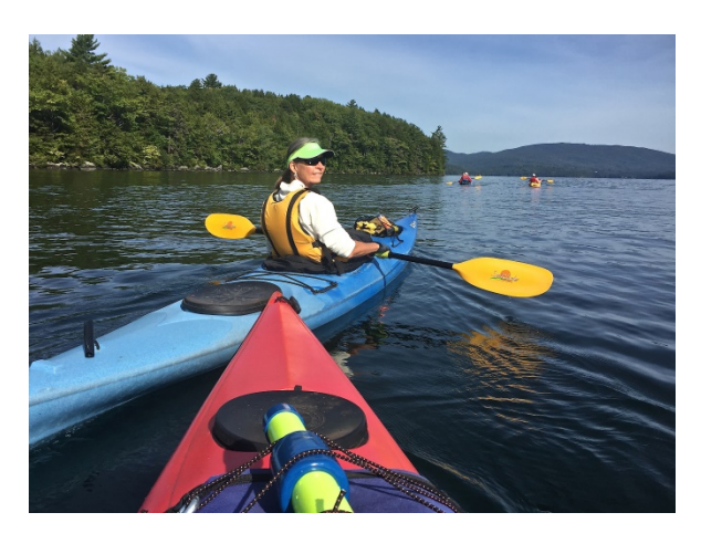
Cardigan Lodge