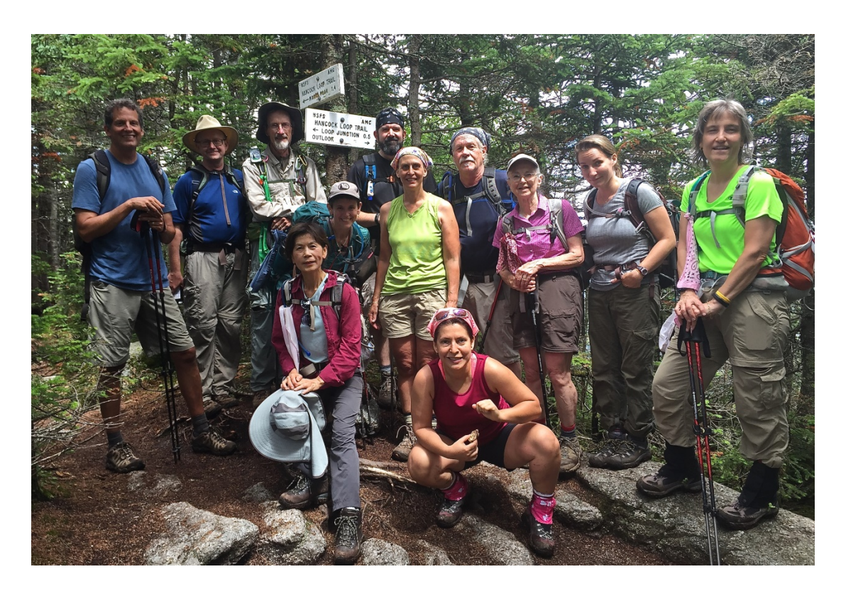
The Crew on South Hancock