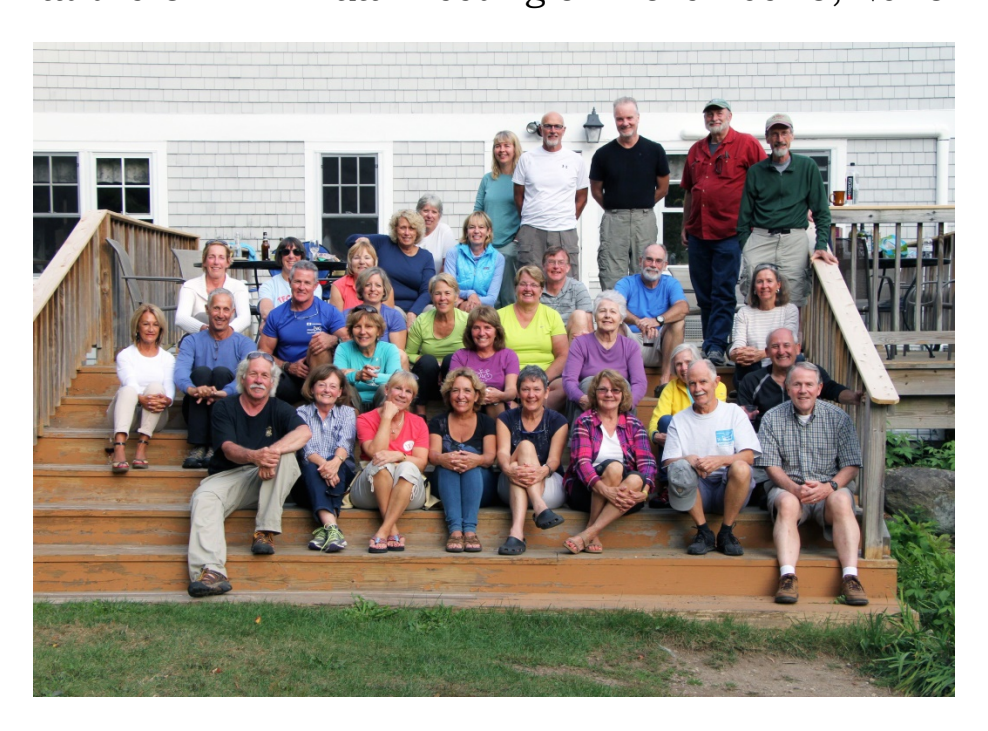
Chapter Hut Weekend, Cardigan Lodge, September 2016

Presented to the members of the Appalachian Mountain Club, Southeastern Massachusetts Chapter at the SEM Annual Meeting on November 5, 2016