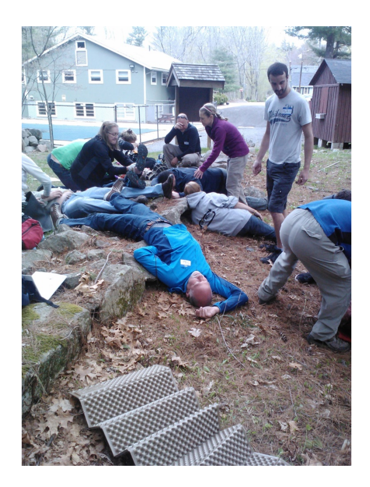
Help! They're all unconscious! WFA