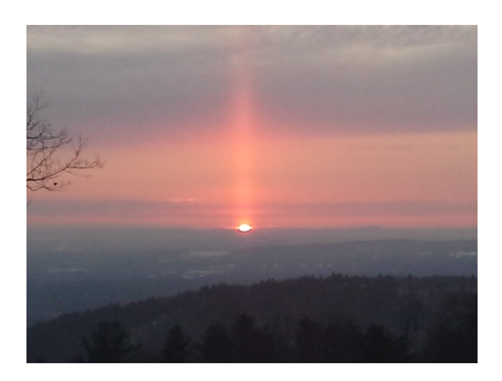
Sunrise at Noble View