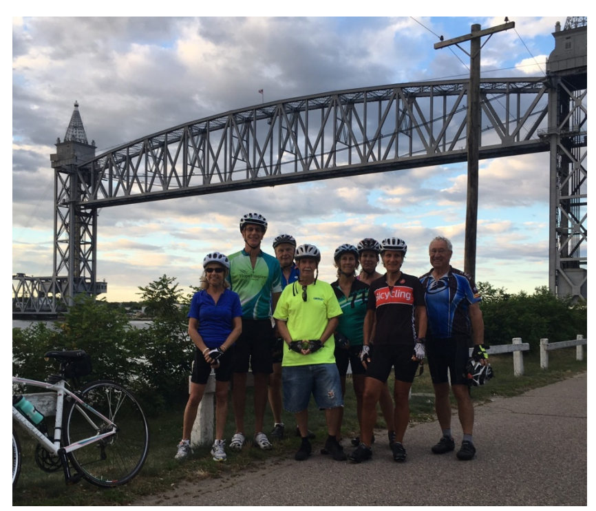
full moon ride July 2016 under the railroad bridge