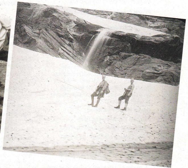
Two of the oldest-known photos from the New York and Worcester chapters capture outings to New Hampshire. New York members (above left) climbed Mount Whiteface in 1924, while Worcester members (above right) visited Tuckerman Ravine in 1920.

Learn more about all 12 AMC chapters at outdoors.org/chapters and check out amcworchester.org for Worcester Chapter centennial events.