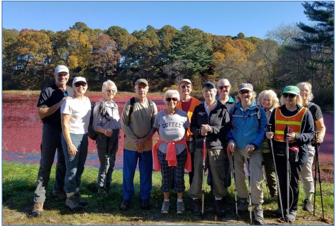
Hikers on the Cape enjoyed the unseasonably warm weather, the changing fall colors, and a harvested cranberry bog.

Business ads start at just $15/month. Send inquiries to breeze.editor@amcsem.org