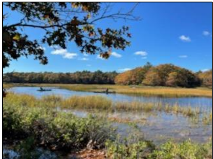
Serenity on the Back River.

On October 27, thirteen hikers enjoyed a glorious sunny day to hike on Bourne Conservation Trust and Town of Bourne properties. The four-plus miles of trails took us through the Bourne Sisters, Perry Woodlands, and the Leary Property. The rolling hills through wooded paths gave way to a wet picked bog and later the views of Back River.