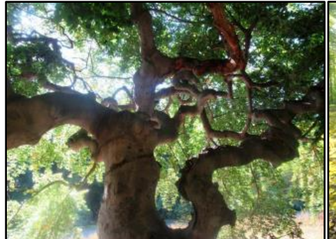
European tortuosa beech