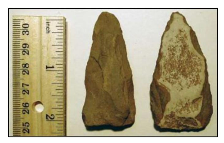
Stone points made by the Massachusett people for hunting game in the Blue Hills.

Then think back 10,000 years to the people who lived here then. Who came to the Blue Hills to quarry the best stone for tools and spear points. Think what their lives would have been like. Chipping stones, carrying them back to their villages along the shores of Ponkapoag Pond, or the Neponset River. Making those spear points and then hunting supper through these woods. Think of the changes that happened over the next 9600 years, before Europeans arrived. Think what the Blue Hills were like through all those thousands of years. We aren't the first ones to think of the Blue Hills as a special place.