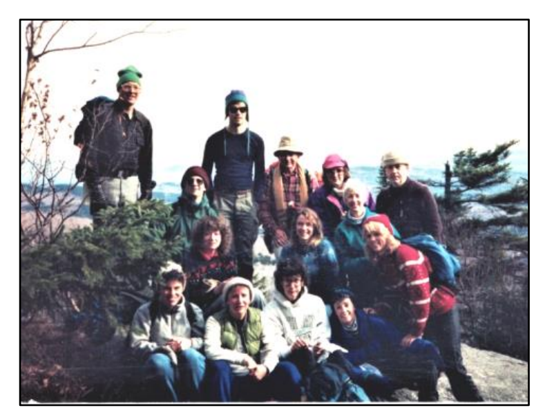
The last AMC-SEM group to stay at Little House for the Mount Cardigan weekend, November 1991.