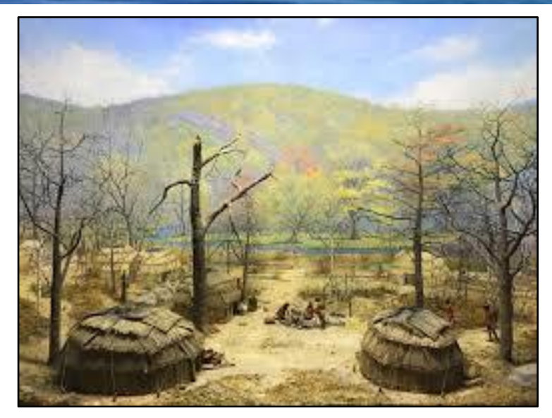
Illustration of a Massachusett village in the Blue Hills from the DCR Blue Hills Reservation Trail Map and Guide.