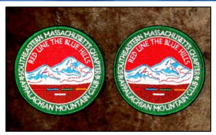
Two RLBH badges earned by the author despite COVID-19 restrictions.