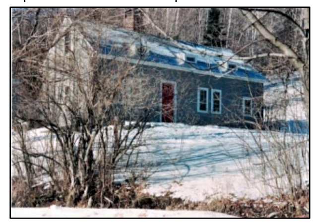
Little House in its heyday.

For the Leaders, it was a very busy weekend of buying food, planning, and organizing hikes for 22. This was a fun and enjoyable weekend for all that can never be duplicated again. Little House was eventually torn down. Solar panels now stand in its place.