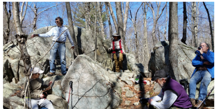
trail workers take a break for lunch at Split Rock in Borderland