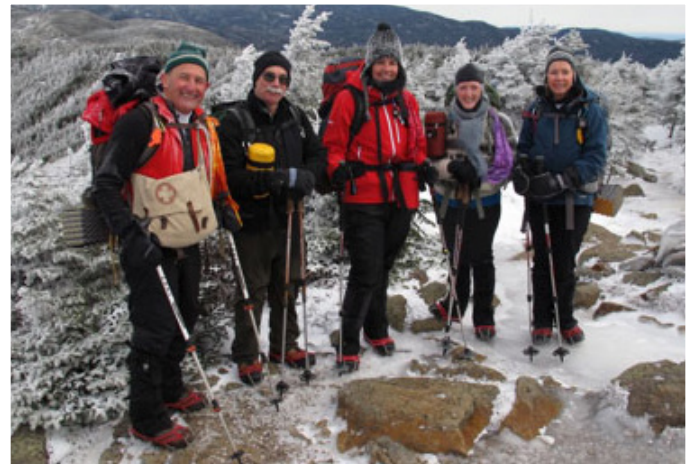
Photo: SEM Winter Hikers atop Mt. Pierce in the Presidential Range of NH