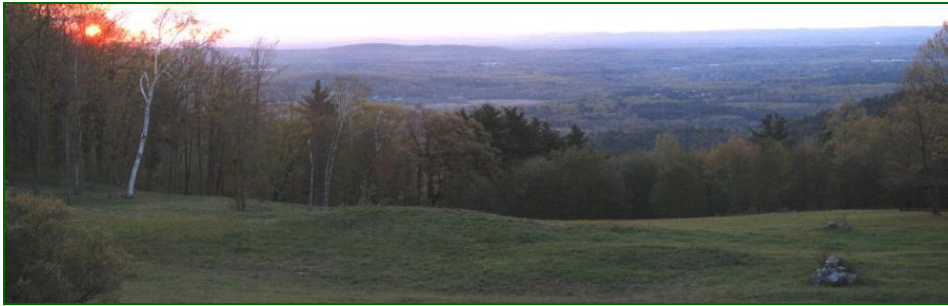
Noble View Sunrise-Panorama

What a great turnout and smashing good weekend, April 28-29. We were filled to capacity and turned many away. (Sign up early next time!) Attendees came from SEM, Boston, Narragansett, and Mohawk Hudson. 15 took SOLO-taught WFA training (11 from SEM) and 8 enjoyed a social weekend taking in fabulous views and hiking trails for all abilities, bubbling brooks and waterfalls, spring wildflowers and flowering