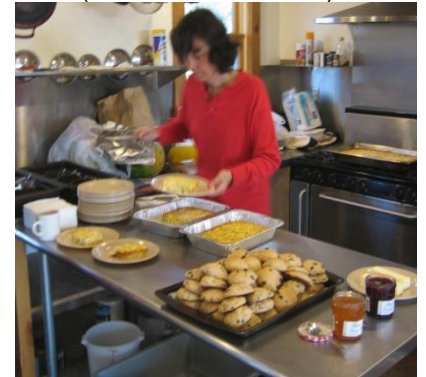
EXECUTIVE CHEF EXTRAORDINAIR (HOMEMADE SCONES)