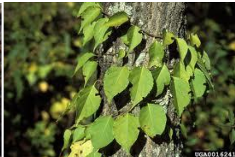
Oriental Bittersweet Leaves