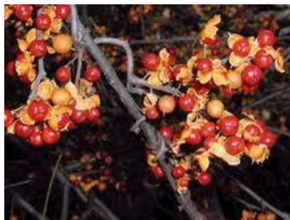
Oriental Bittersweet Fruit

Oriental Bittersweet, Burning Bush, and Norway Maple are just some of the plants we have introduced that have become invasive. Oriental Bittersweet is a woody vine that was introduced into the United States in the 1860s as an ornamental plant and is often associated with old home sites from which it has escaped into surrounding natural areas. It infests forest edges, woodlands, fields, hedgerows, coastal areas, and salt marsh edges, especially those suffering some form of land disturbance. While often found in more open, sunny sites, it also tolerates shade allowing the oriental bittersweet to invade forested areas.