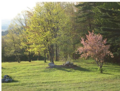
SPRINGTIME FLOWERING TREE