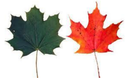
Left Norway Maple, Right Sugar Maple

Norway Maples are native to Europe, from Norway southward. In the United States, they either escaped from cultivation or are the offspring of trees used as ornamental specimens. The Norway Maple frequently invades urban and suburban forests. Its extreme shade tolerance, especially when young, allows it to penetrate beneath an intact forest canopy. Research has recently shown that forests, which have been invaded by Norway Maple, suffer losses in diversity of native forest wildflowers compared with forests in which the canopy is dominated by native species such as sugar maple. This is at least in part due to the dense shade cast by Norway maples, and the shallow roots, which compete with other vegetation. They also produce a large quantity of seeds that can germinate rapidly and crowd out native species.