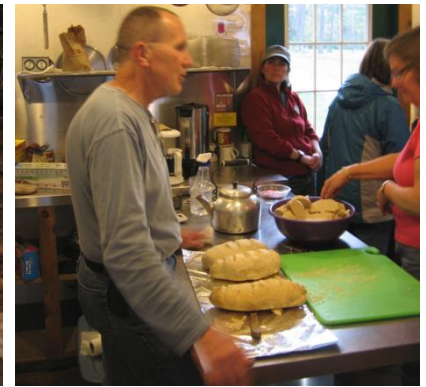
OUR SOUS CHEF (HOME MADE BREAD)