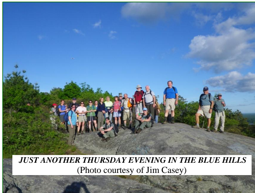
JUST ANOTHER THURSDAY EVENING IN THE BLUE HILLS

Did you read the May/June issue of the hardcopy AMC outdoors magazine? Did you see the picture of the SEM hikers on page 41?