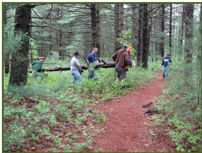
TRAIL WORK by SEM MEMBERS