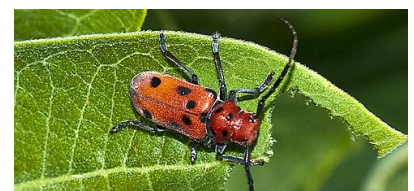
The Tuesday Evening "Discover Nature" series is discovering all sorts of things!