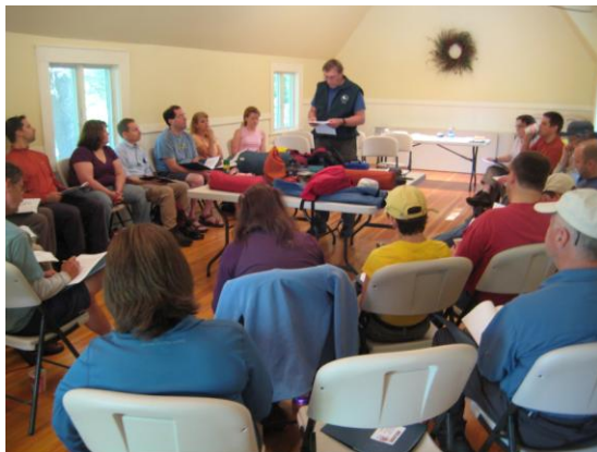
A ROOMFUL OF EAGER LEARNERS AT THE CHAPEL MEETING HOUSE in FOXBORO