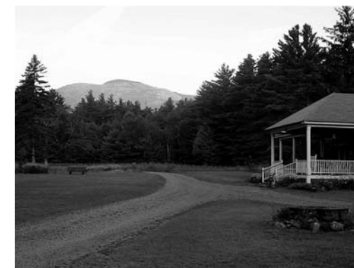
Photos of AMC Cold River Camp