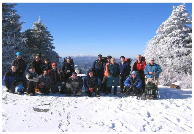
The group poses on the summit of Pack Monadnock with Grand Monadnock visible in the background

Several participants had carpooled from the "park & ride" lot on Route 106 just off Route 24 (including two members who came up from way out on the Cape). Others, myself included, drove up to NH by themselves.