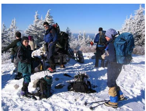
On North Pack Monadnock summit...

All in all, a great day with a great group of people!