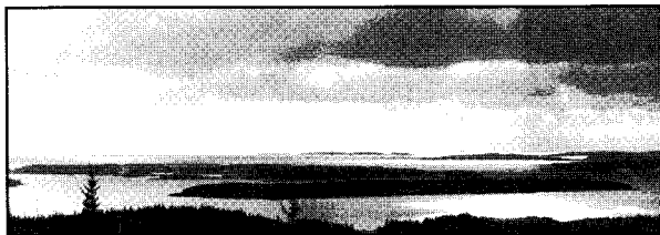
Looking east from Mt. Desert Island, Maine

Mon Aug. 6 Harding Beach. From Rt 28 Barn Hill Rd to Beach Rd to Harding Beach.